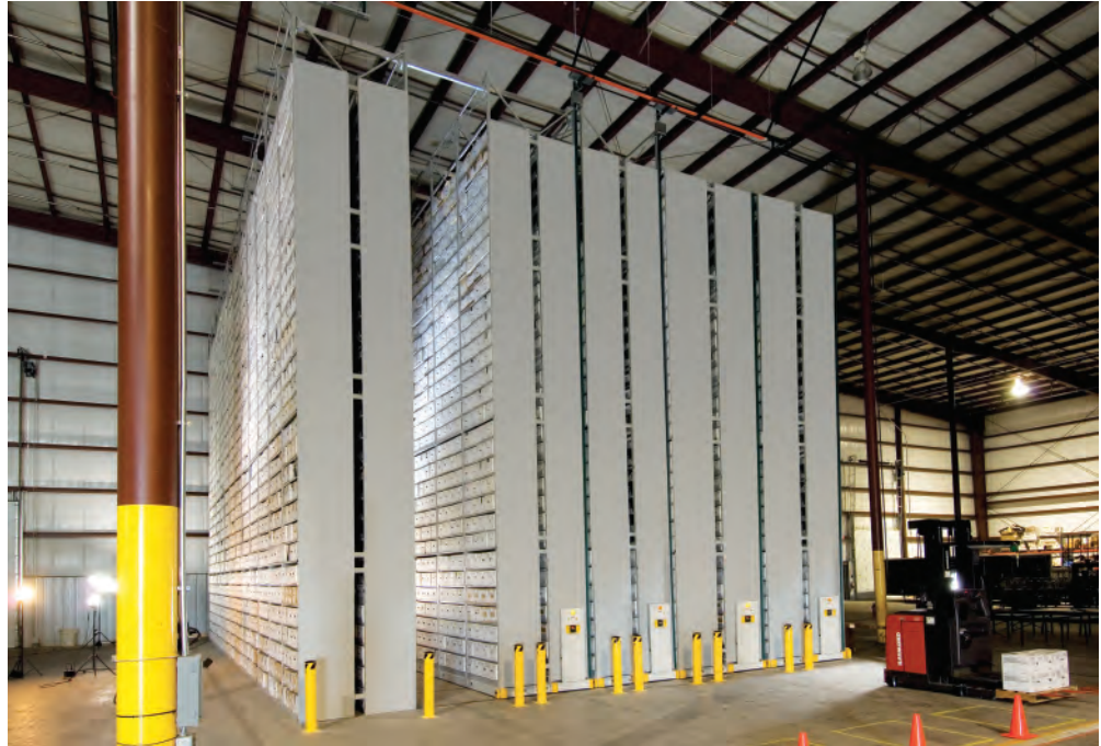
Stoffel and Spacesaver integrate Very Narrow Aisle trucks into storage system.